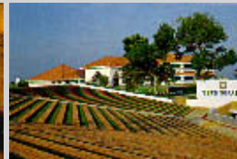
Open air auditorium