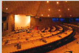
Main conference hall

A dedicated 64K line will be available throughout the conference. Full internet facilities will be available to attendees, including hands-on support.