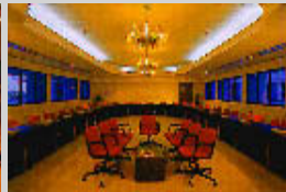
Small conference hall